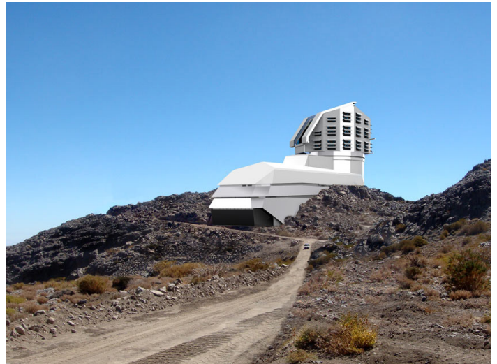
A photograph and a rendering mix, showing a view of the Large Synoptic Survey Telescope's exterior building, from the road leading up to the site, a mountain peak in northern Chile called Cerro Pachon.

Equipped with a 3-billion pixel digital camera (the world's largest digital camera), LSST will observe objects as they change or move, providing insight into short-lived transient events such as astronomical explosions and the orbital paths of potentially